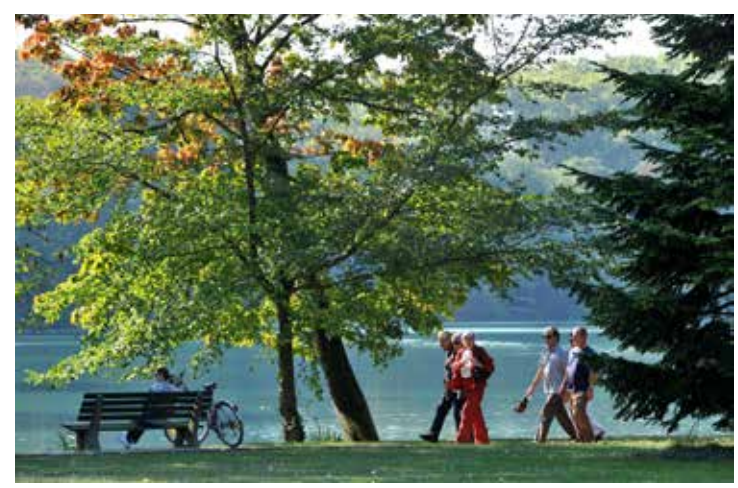
Tête d'Or Park

Throughout the whole city, plant pots are recomposed to play an anti-stress role. They adapt themselves to the atmosphere of the district but also to climate change problems. At the same time, Lyon has a very sustainable development approach.