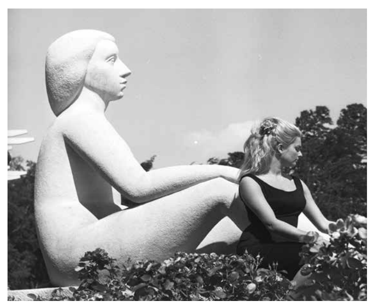
the rose garden is used as a setting for photo shoots

In 1849, JB Guillo son builds a graft that will revolutionize the cultivation of the rose. He builds the rose "La France", the first flower of the tea hybrid family to be marketed: (crossing between european and chinese varieties): bright pink on the exterior and silver in the interior, it opens the path to the modern rose, coloured and surprising.