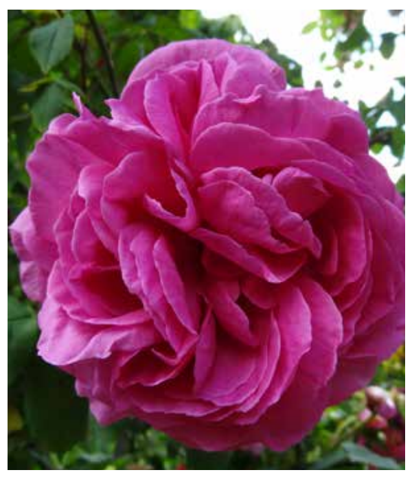
Rose 'Madame Isaac Pereire' - Bourbon

These rose creators are genuine artists who combine technical movements, patience, intuition and even genetic knowledge to select new original and exquisite varieties that will enrich our rose gardens of the 21st Century. Today, this excellent research is supported and relayed by the scientific studies driven by the laboratories in Lyon.