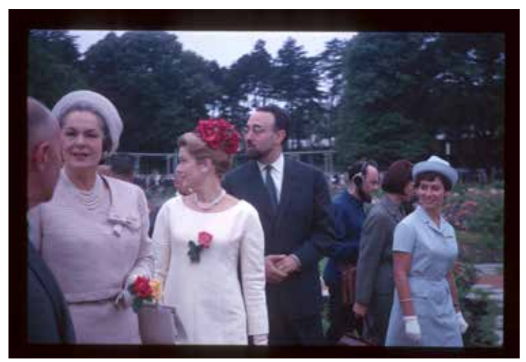
Inauguration of the International Rose Garden of Lyon - 1964