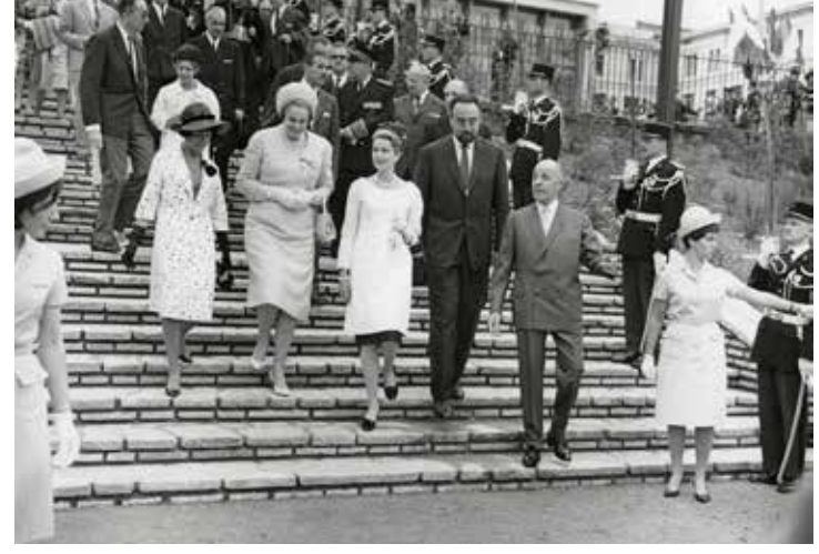
Inauguration de la Roseraie Internationale de Lyon - 1964

Olfactory visits and creative paths will also be delivered by the Beaux-Arts Museum. On May 30th and 31st, historical bouquets inspired by pieces of art from the museum will be presented.