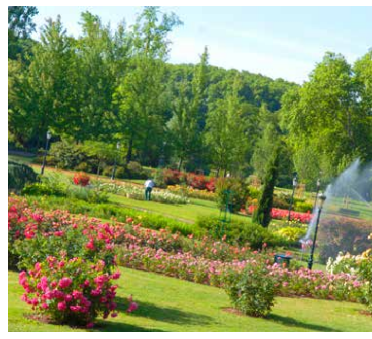
Big Rose Garden at the Tête d'Or Park

The genomic news of the rose, its results and perspectives will be in the heart of the discussions. Six conferences and two workshops will be organized for the 200 French and foreign participants, amongst which numerous researchers, agronomists and cultivators.