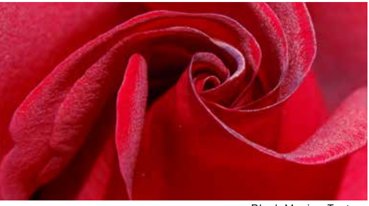
Black Magic - Tantau