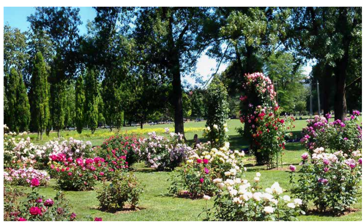
Big rose garden in the Tête d'Or Park

The culmination point of the festival will be on May 29th, 30th and 31st in the city center of Lyon in 3 emblematic places, and will also happen in the Tête d'Or Park with a weekend of animations dedicated to the rose.