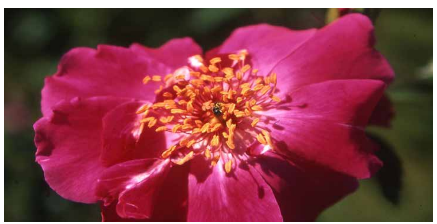
'Gloire des Rosomanes' - Plantier