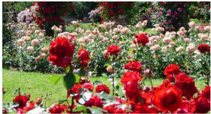
Big rose garden in the Tête d'Or Park