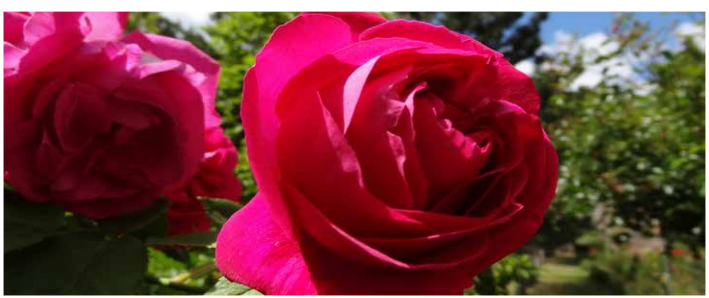
Rose 'Baron JB Gonella' - Bourbon

For producers and breeders, hosting a professional event in Lyon is a consecration. It is the acknowledgement of everything they have brought to the research and creation of roses for several generations. It will also be the occasion to prove their expertise and present their very last creations.