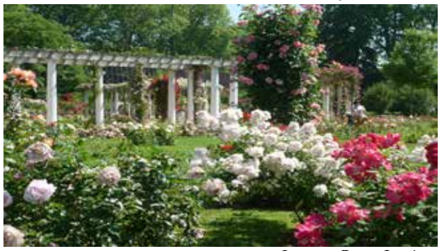
Contest Rose Garden