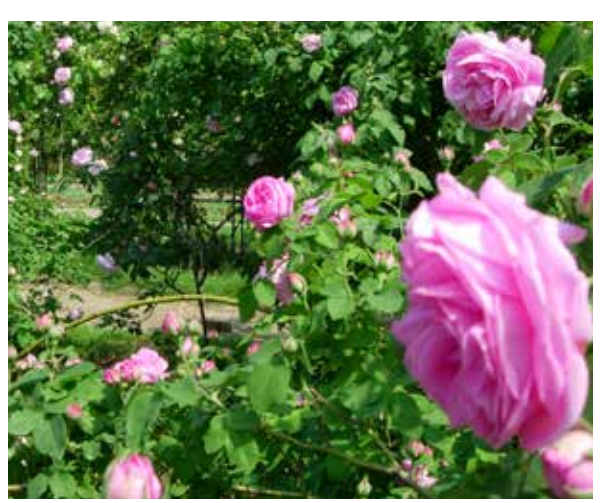
The Botanical rose garden

The International Rose Contest will take place on Friday, May 29th 2015 and the French Society of Roses will designate the winners.