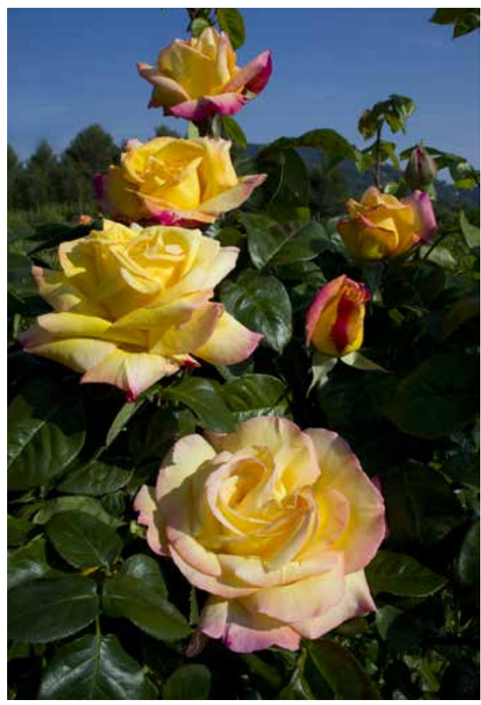
Rose 'Peace ' - Meilland

THE SHOPPING CENTERS, Galeries Lafayette, Part-Dieu and Confluence will also be associated to the event and will propose animations to do with the rose.