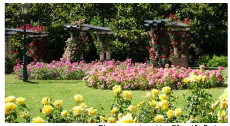
Big rose garden at the Tête d'Or Park

Today, still 50% of the European cultivators (the creators of new roses) come from Lyon and there are around 20,000 roses in the gardens and rose gardens in Lyon. These gardens are being used as a protection for older roses but also as an area of discovery for modern roses. This precious past will blossom into multiple forms during this 2015 spring in Lyon . This year, and for the first time in France, the city hosts this inescapable event for people passionate about roses. During 4 days, the world Convention of Rose Societies will bring together 600 convention delegates from the entire world from May 25th to June 1st.