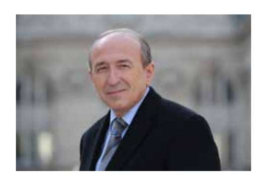
GÉRARD COLLOMB SENATOR-MAYOR OF LYON PRESIDENT OF THE MÉTROPOLE DE LYON

I very much hope to see you amongst us during the celebration in Lyon and wish you an enjoyable and memorable World Rose Festival!