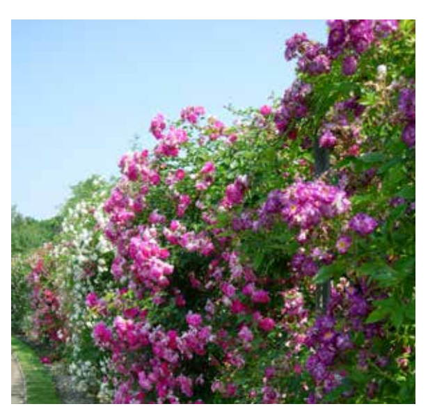
The botanical rose garden

This research is an economic challenge for the future of the rose in France because of other international laboratories in the USA, in Australia, in Japan, the Netherlands and Israel. Nevertheless, the 21st century rose will probably be more robust, more diseaseresistant, more flowery and above all... more scented!